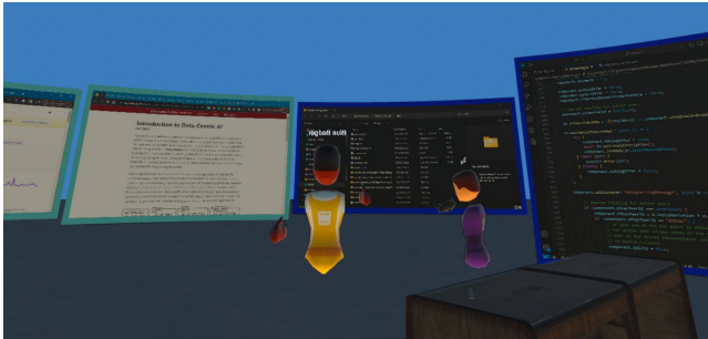
Figure 1: Multi-screen streaming in a collaborative environment.