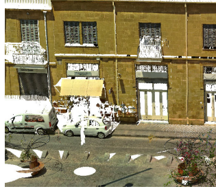
Figure 5: Dense laser point cloud model from a FARO scanner.

suitable for real-time on-device rendering on the employed head-mounted displays (HMDs), we simplified and cropped the model. In the remainder of this subsection, we discuss the reconstruction process of the model used in our prototype.