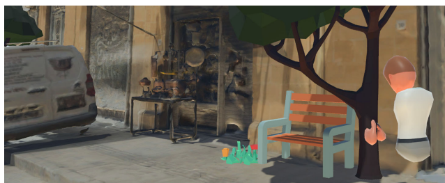
Figure 2: A VR user placing greenery and a shaded park bench in the collaborative virtual environment.

Our prototype system is built using the open-source social VR framework Ubiq [9] (Unity version 2020.3.40f1) and is based on an existing implementation of an asymmetric CMR system [25]. Our system supports collaboration between a local outdoor AR user and remote VR users. Users are represented as randomly assigned avatars from the Ubiq platform, featuring a head, an upper torso, and floating hands with a hand-closing animation. They experience the CMR