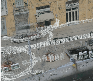
Figure 4: Photogrammetry point cloud model with image poses.