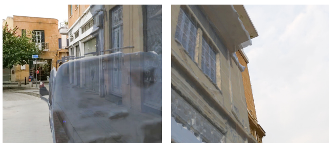
(A) A car captured in the mesh model which was no longer on-site at the time of our test. (B) An extreme case of poor tracking causing misalignment between the model and the real building